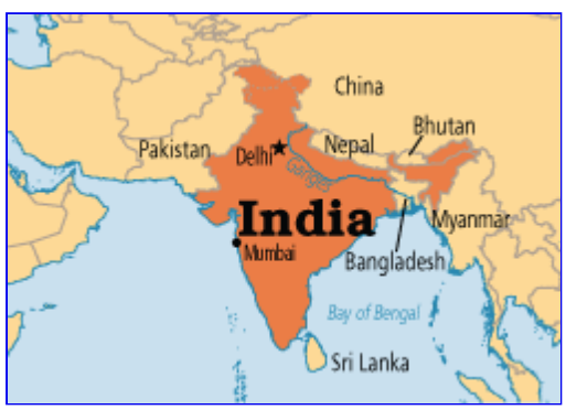
click map to enlarge